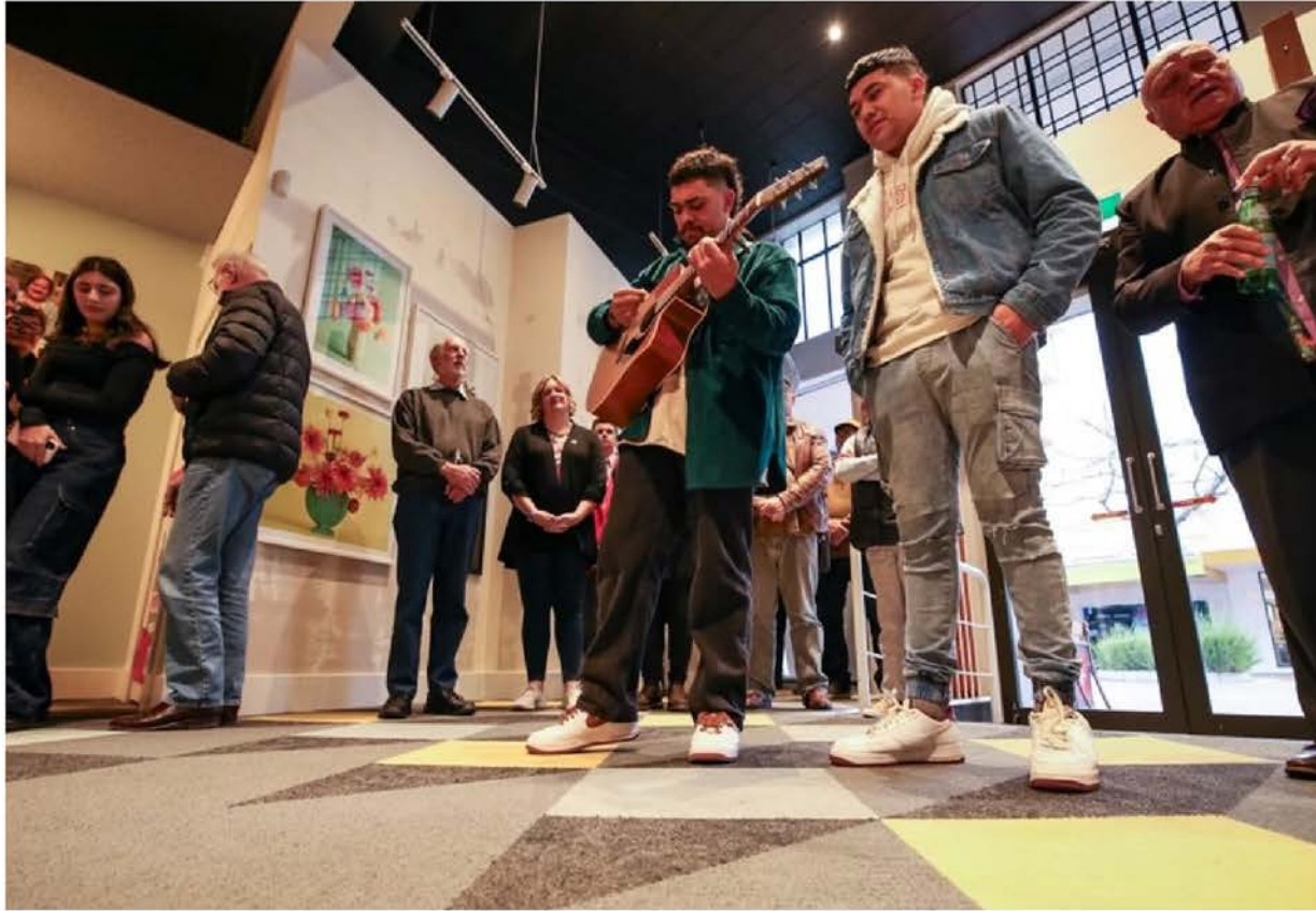
2024 Festival opening