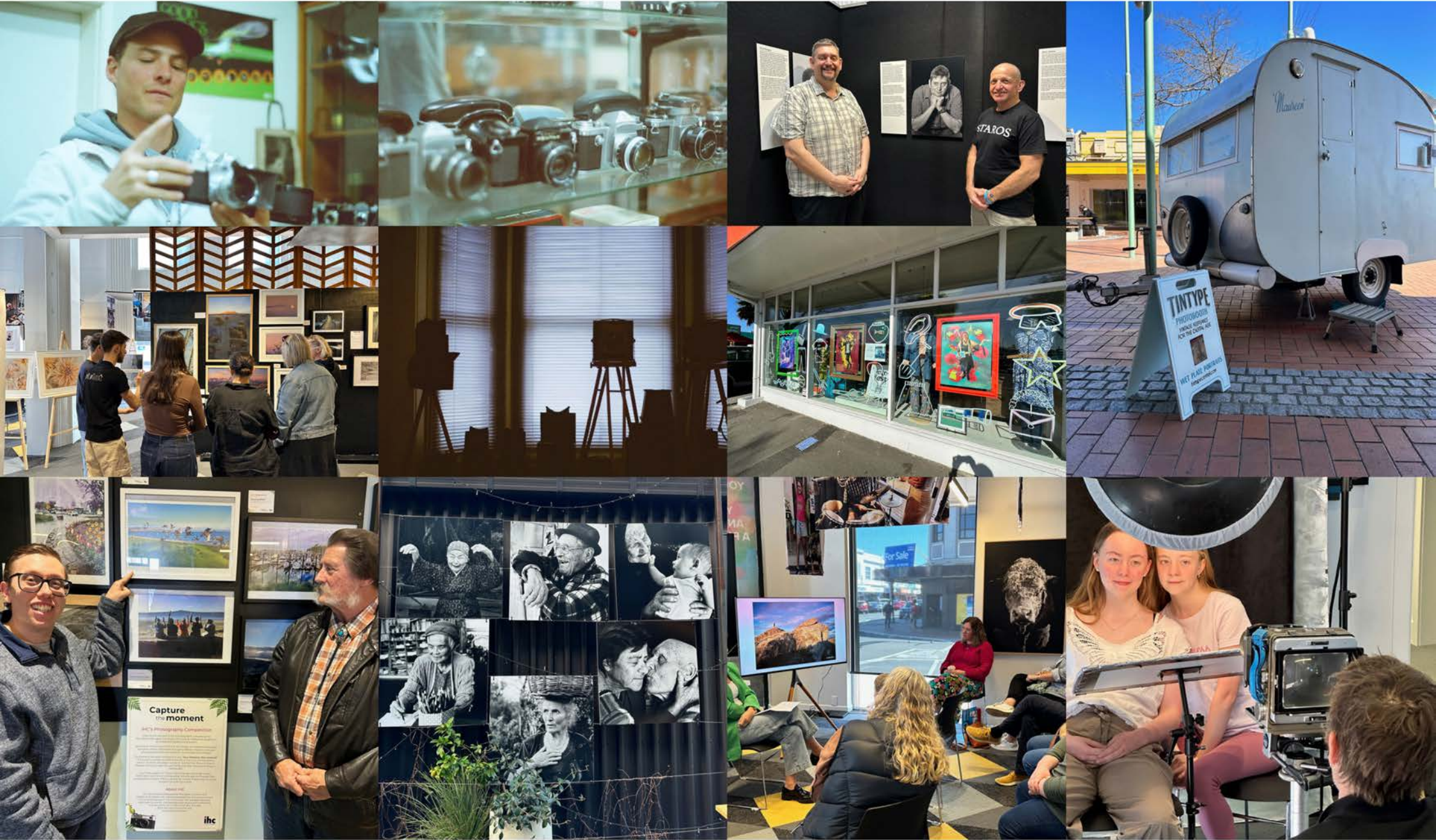
Camera Museum Tour, Cranford Hospice Window, Tintype wet plate photo shoot, IHC competition winner